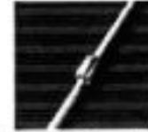
DO-204AH (DO-35 Glass)